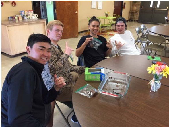
CAYAC enjoying a meal on Monday evening.

We Turned 129 in March. Happy Birthday FPC.