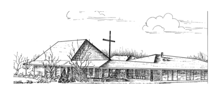
GRACE. HOPE. LOVE.

NEWBERG FIRST PRESBYTERIAN CHURCH 501 MISSION DRIVE NEWBERG, OR 97132