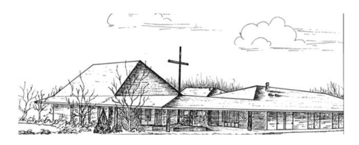
GRACE. HOPE. LOVE.

NEWBERG FIRST PRESBYTERIAN CHURCH 501 MISSION DRIVE NEWBERG, OR 97132