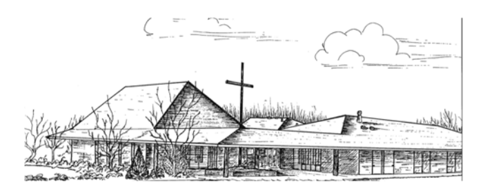
GRACE. HOPE. LOVE.

NEWBERG FIRST PRESBYTERIAN CHURCH 501 MISSION DRIVE NEWBERG, OR 97132