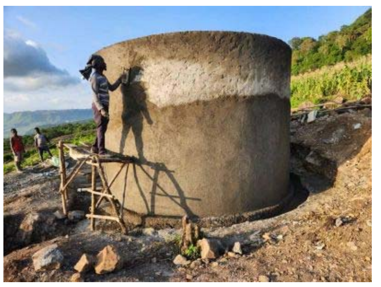
The professional crew, brought in from another part of Southern Ethiopia, continued on, plastering the reservoir inside and out, and constructing a lid to keep the water clean.