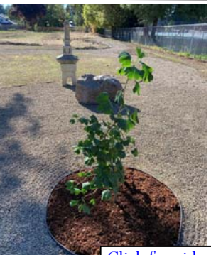
Click for video on the Peace Garden

But you can also provide tangible gifts in the form of suitable art pieces, fencing, irrigation/sprinklers, benches, trees, flower bulbs, gravel for paths or